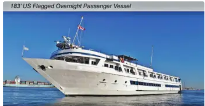
183' US Flagged Overnight Passenger Vessel